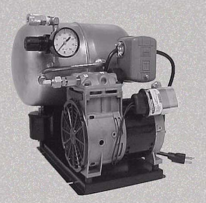
Model 99-2101 Shelf-Mount (for use on 2 or 3 wide BIB top shelf)