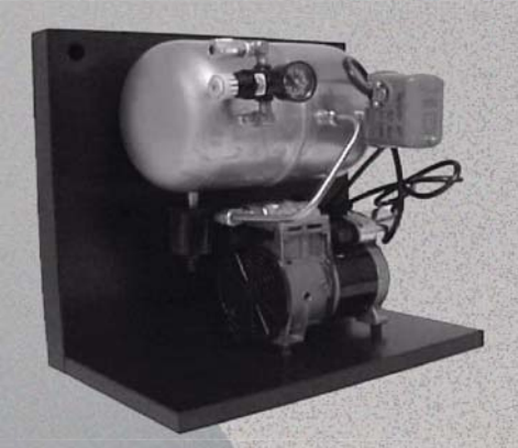
Model 99-2201 Wall-Mount