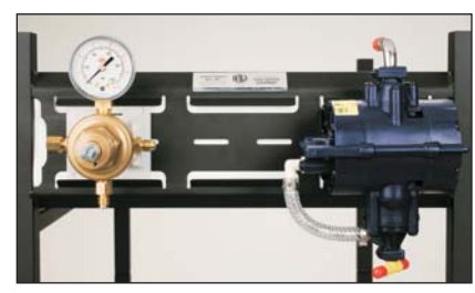
Regulator and Syrup Pump Mounted on Louvered Panels