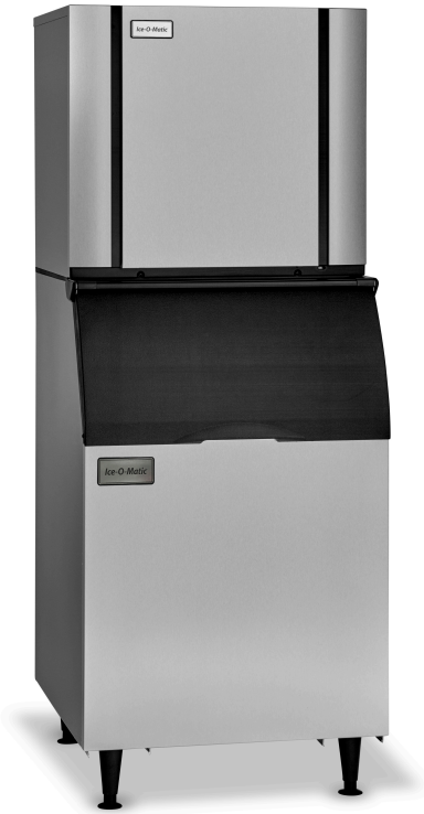
CIMO836 ON B55