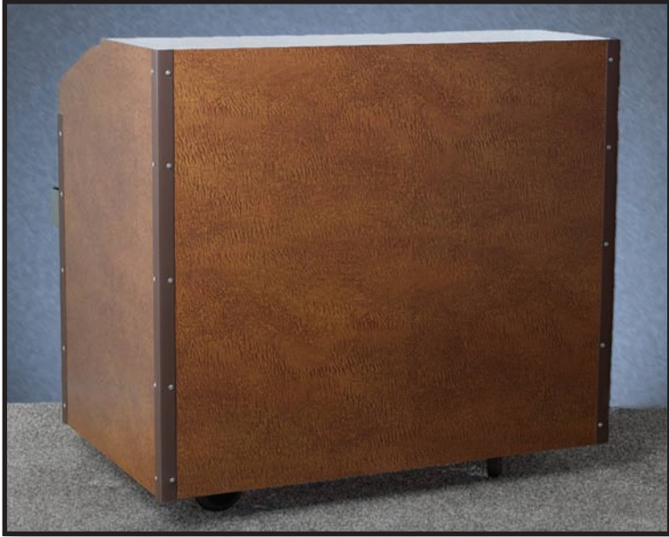
C - 48 Front