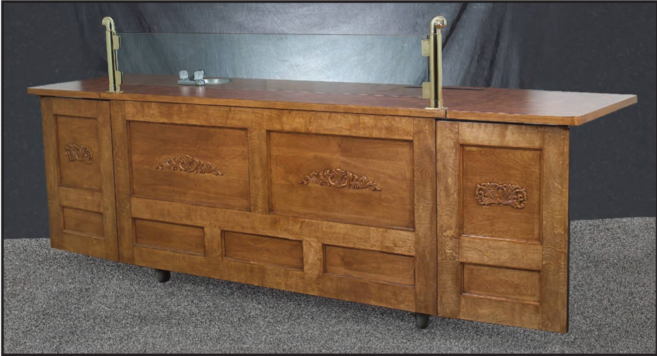
Regal Espresso Bar