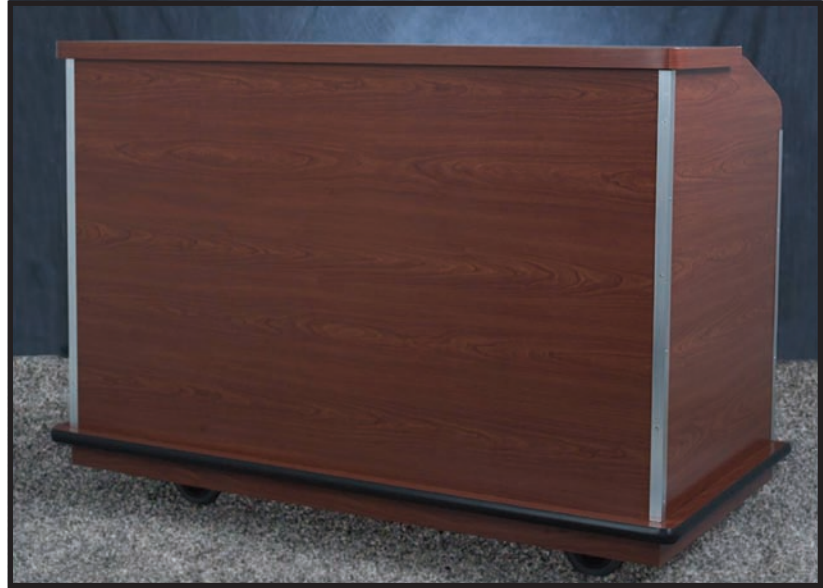
C - 60 Front