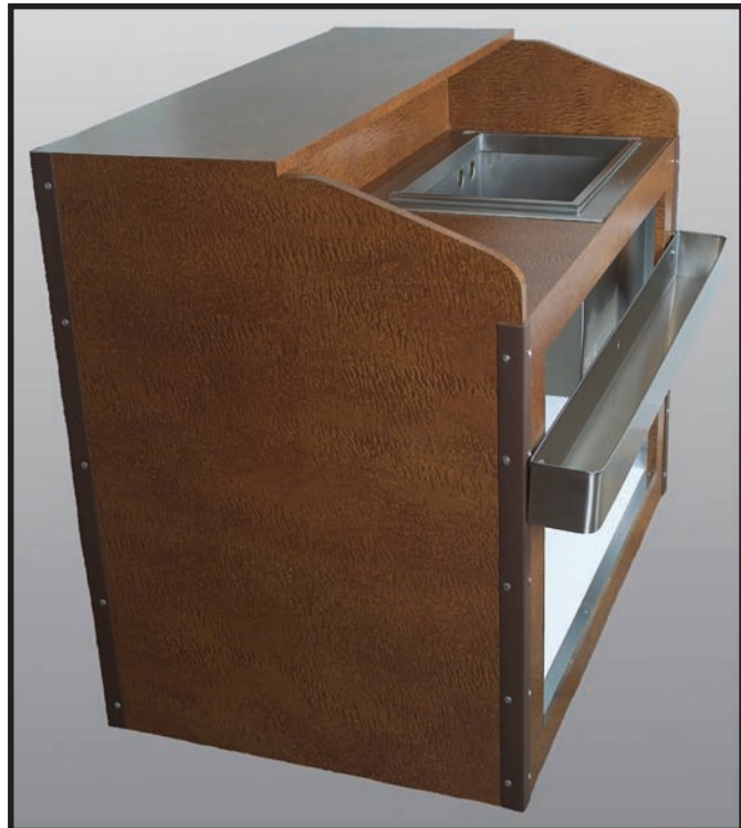
C - 48 Back