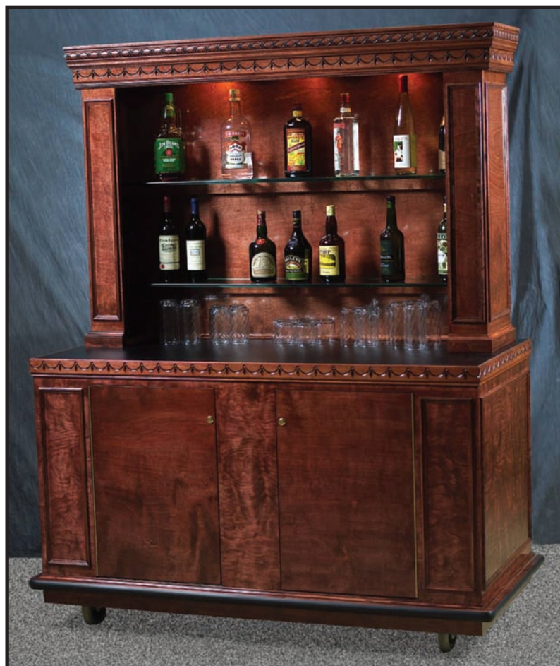
Regal Tall Back Bar

All bar photos are Mann's standard product line - Custom orders always welcome