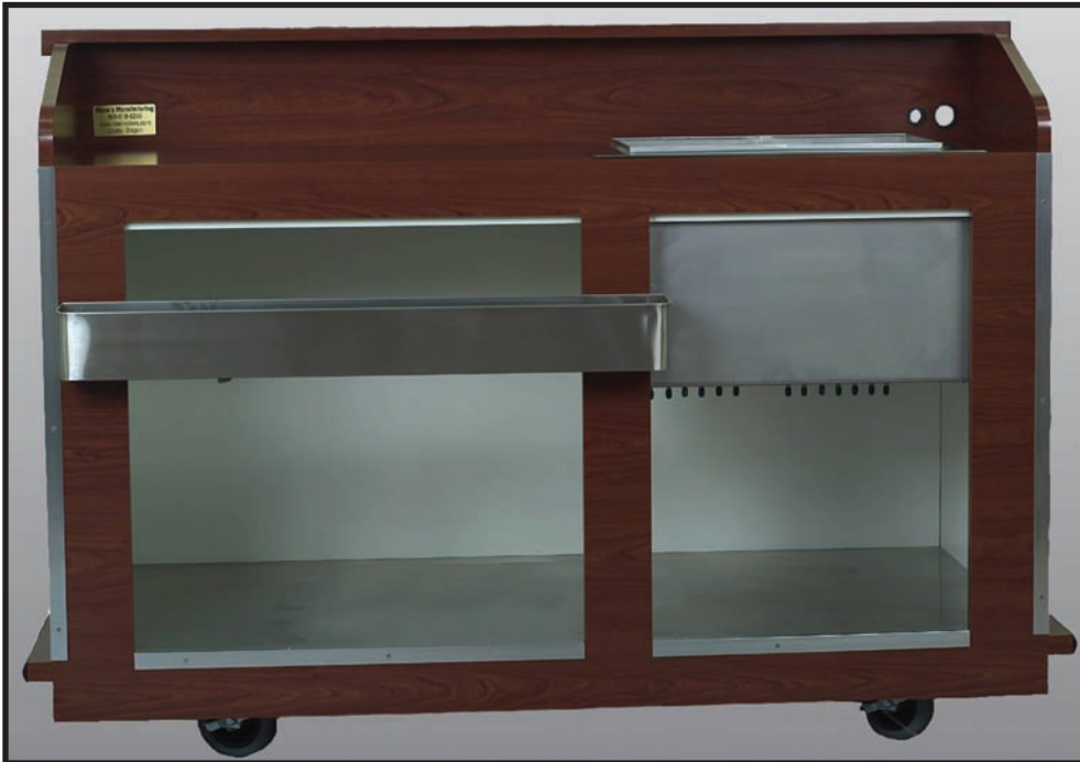
C - 60 Back