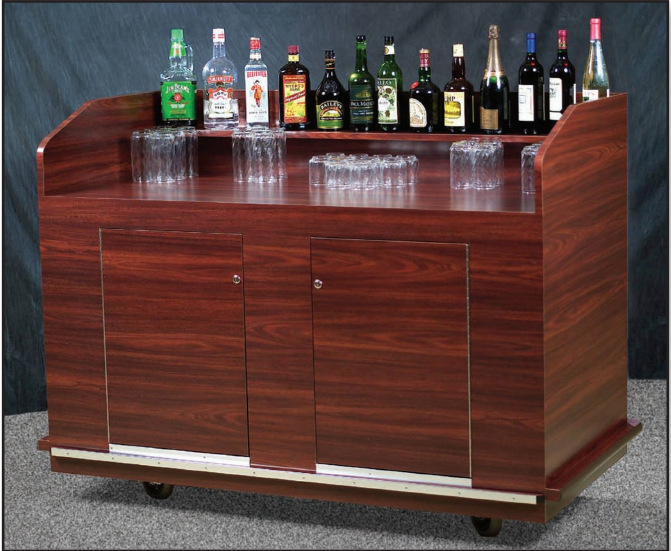
Classic Short Back Bar