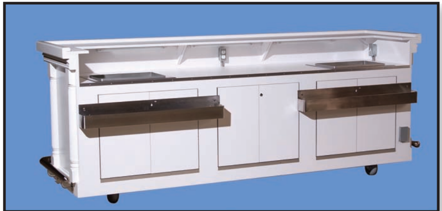
Mann's custom bar - Arlene Schnitzer Concert Hall Portland, Oregon