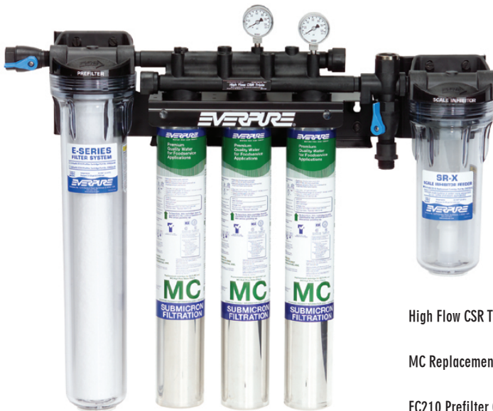
High Flow CSR Triple-MC System: EV9328-06

NSF Certified under NSF/ANSI Standards 42 and 53