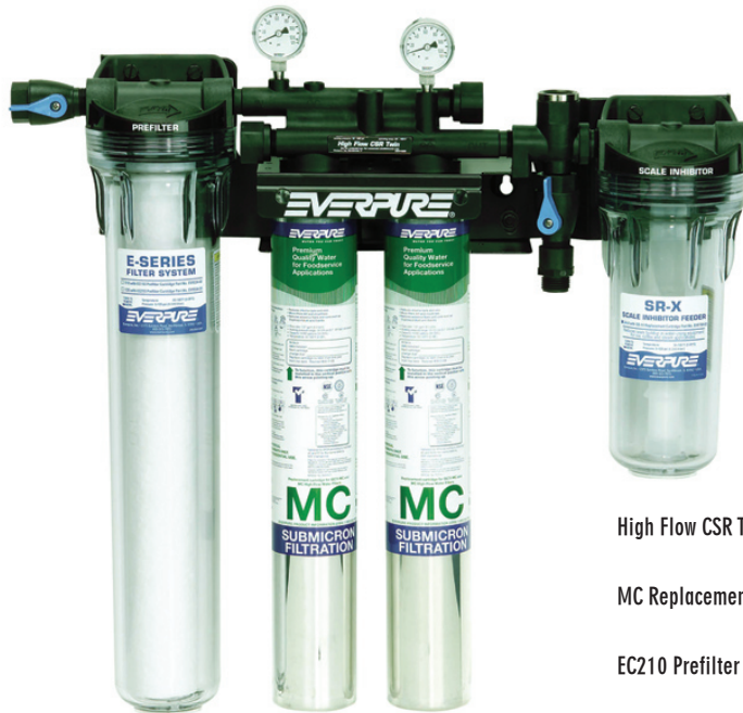
High Flow CSR Twin-MC System: EV9330-42

Delivers premium quality water for combination applications