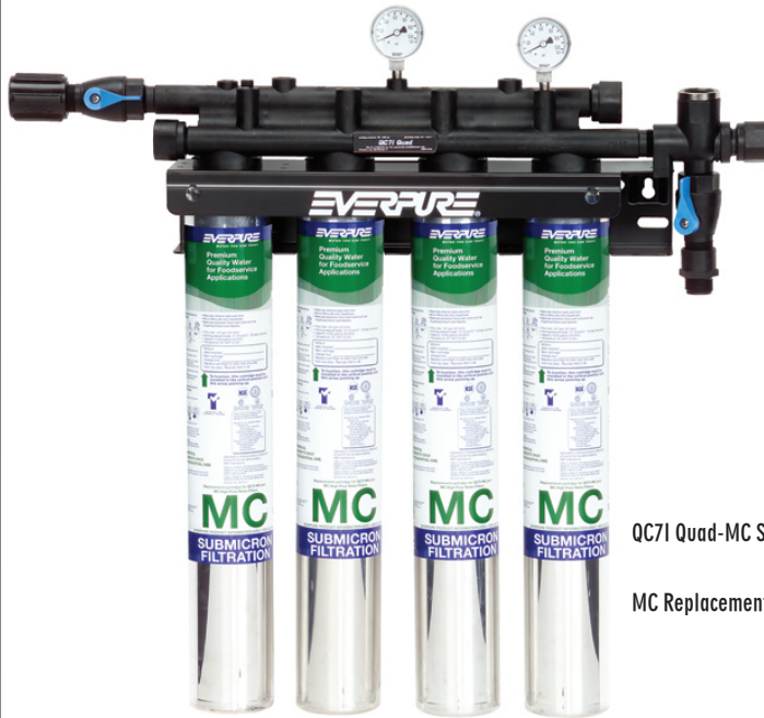
QC7I Quad-MC System: EV9337-11

Delivers premium quality water for fountain applications