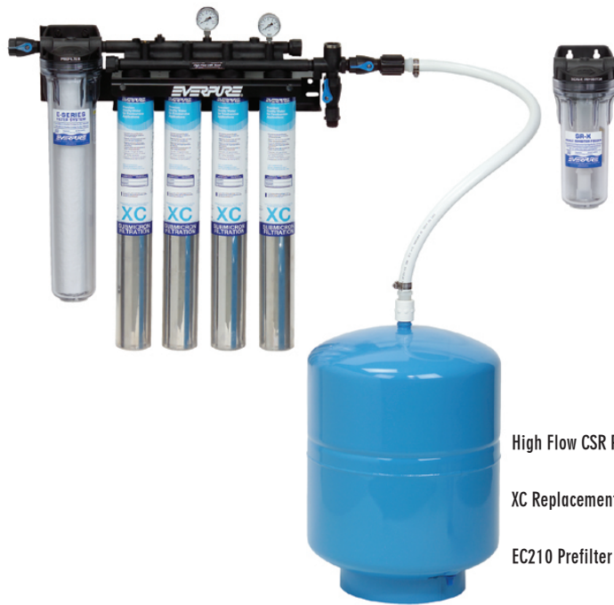
High Flow CSR Plus-XC: EV9347-20

Delivers premium quality water for combination applications