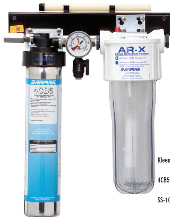
Kleensteam CT System: EV9797-50

Total water treatment system for steam applications