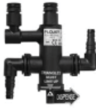
Flow Reversal Valve (see accessories section)