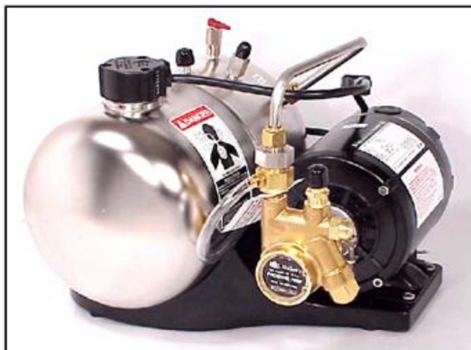
E400397 Big Mac with ASSE 1022 Device