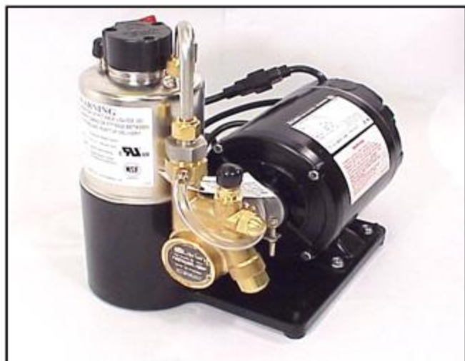
43-5002 Small Carb with ASSE 1022 Device