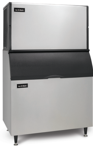
ICE1806 on B100