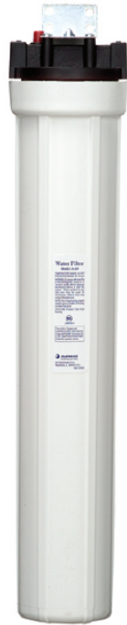
A-20 20" Opaque Housing: EV9100-03