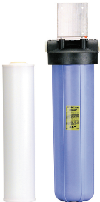
S0-24 Espresso System with Softening Cartridge: EV9100-94

Softening System for espresso applications