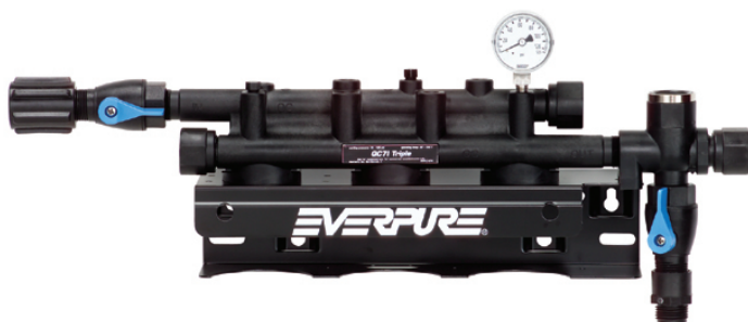
QC71 Triple Parallel Head: EV9272-23

Filter head exclusively for Everpure replacement cartridges