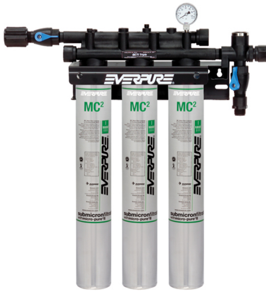
QC7I Triple-MC 2 System: EV9275-03

Delivers premium quality water for fountain applications