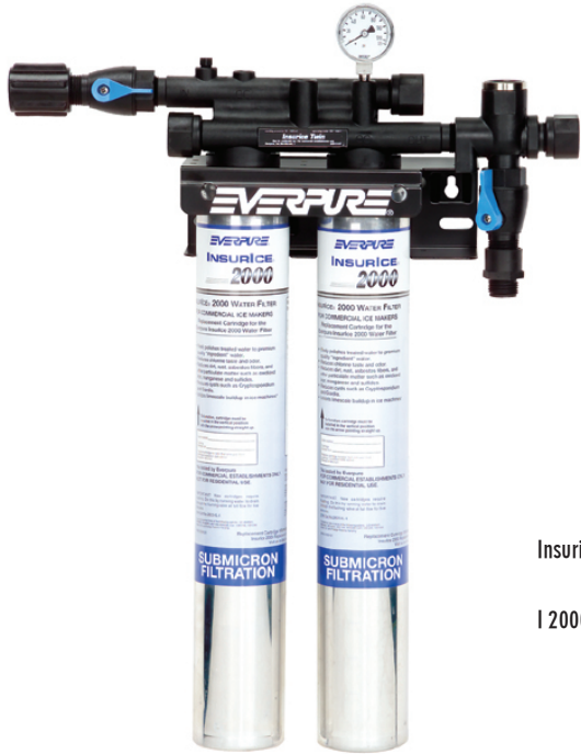
Insurice Twin-I 2000 System: EV9324-01

Delivers premium quality water for ice applications