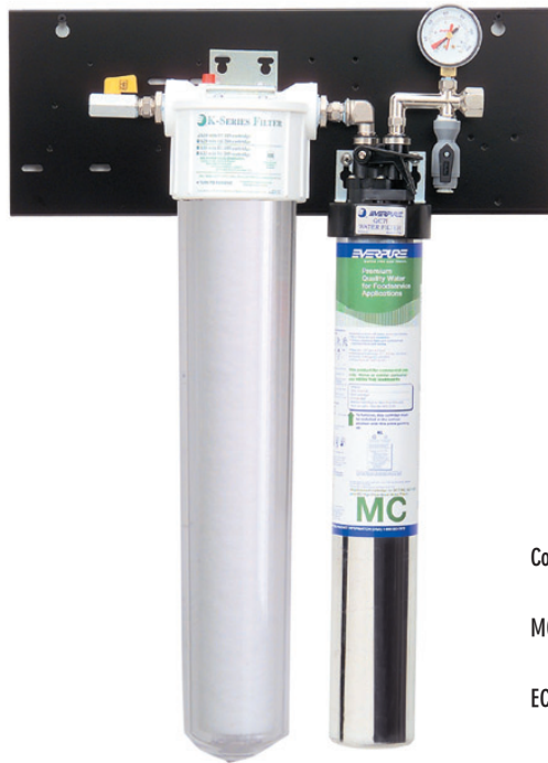
Coldrink 1-MC System: EV9328-01

Delivers premium quality water for fountain applications