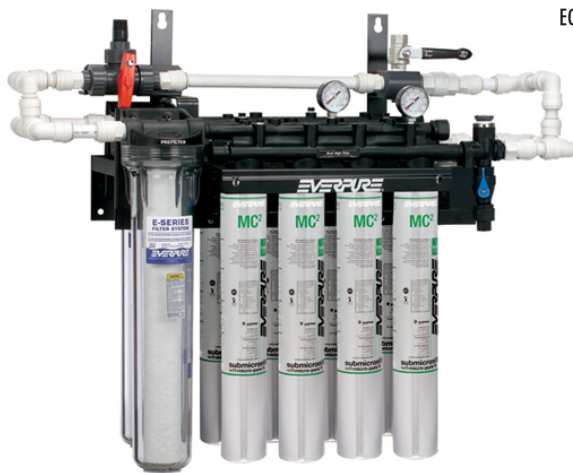
Dual High Flow Coldrink S-MC 2 : EV9337-44 MC 2 Replacement Cartridge: EV9612-56 EC210 Prefilter Cartridge: EV9534-26

Delivers premium quality water for high volume, multiple fountain applications