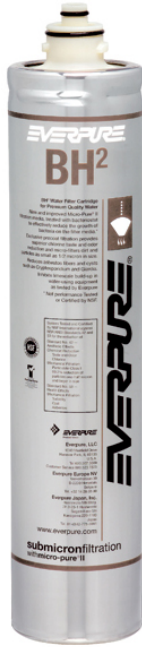
BH 2 Replacement Cartridge: EV9612-50

Delivers premium quality water for coffee applications