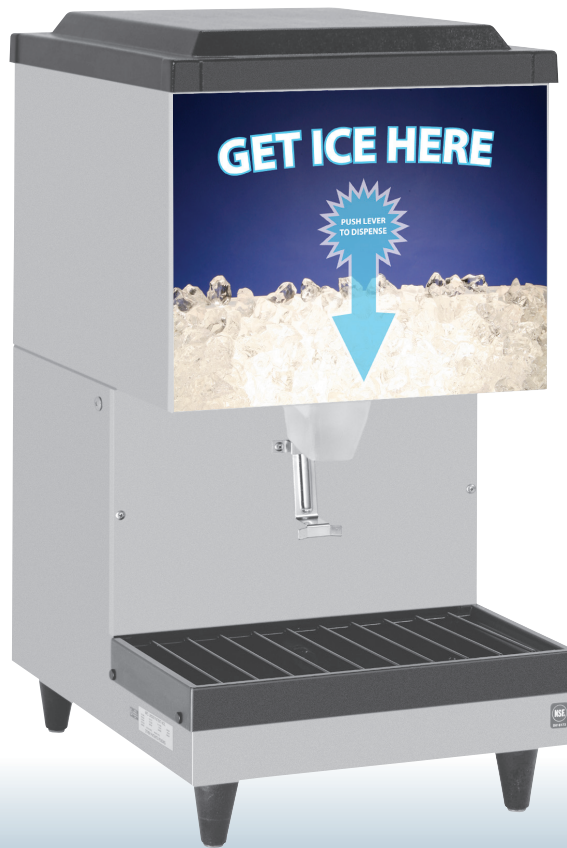
D45 shown with optional "Get Ice Here" decal