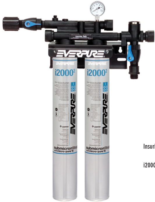
Insurice Twin-i2000 2 System: EV9324-02

Delivers premium quality water for ice applications