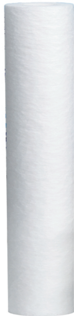
EC110 Prefilter Cartridge: EV9534-12