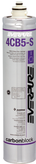
4CB5-S Replacement Cartridge: EV9617-21

Delivers quality water for foodservice, vending and OCS applications