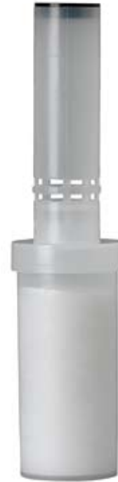
SS-IMF Cartridge: EV9799-42

Replace ScaleStick before Hydroblend compound is completely dissolved.