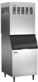
ICE1506HT49 shown atop of bin B55 (sold separately)