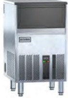
Model or Series