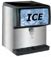
Model or Series