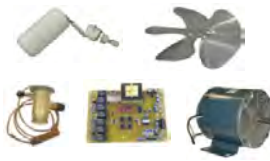
Model or Series