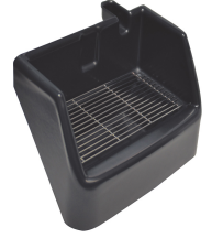
TRAY ASSY, EXTENDED DRIP