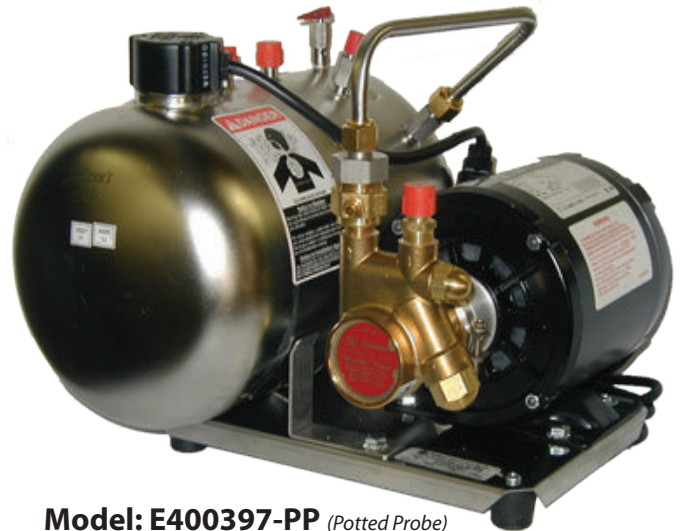
Model: E400397-PP (Potted Probe)