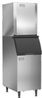
CIM0826HR49 shown atop of bin B42 (sold separately)

See Ice-O-Matic Price List for Adapter Kits to combine ice makers with most available ice/beverage dispensers.